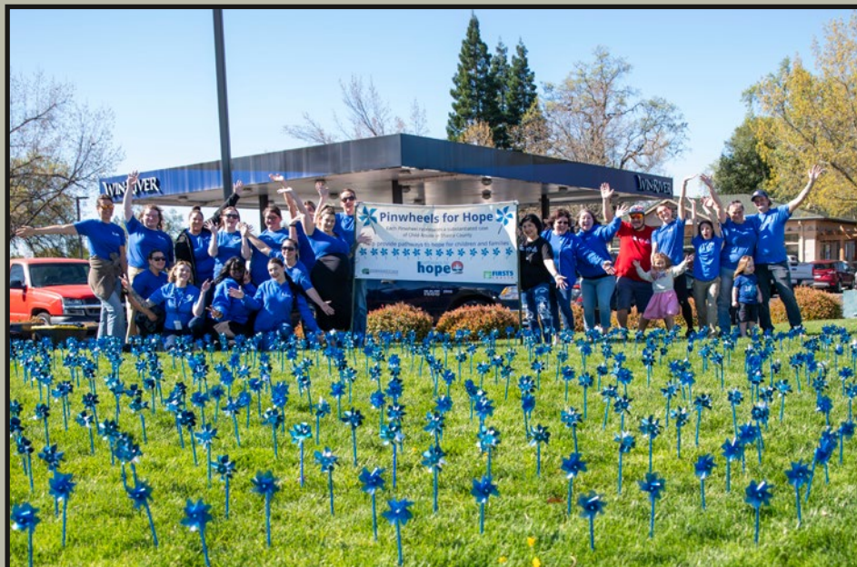
United to Help End Child Abuse