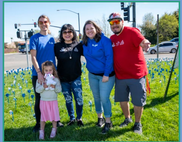
Redding Rancheria staff working with Pathways to Hope

6. April's designation as Child Abuse Prevention Awareness Month serves as a reminder of the ongoing need to prioritize the safety and well-being of children in Shasta County and beyond. Together, we can create a future where every child grows up in a nurturing and supportive environment