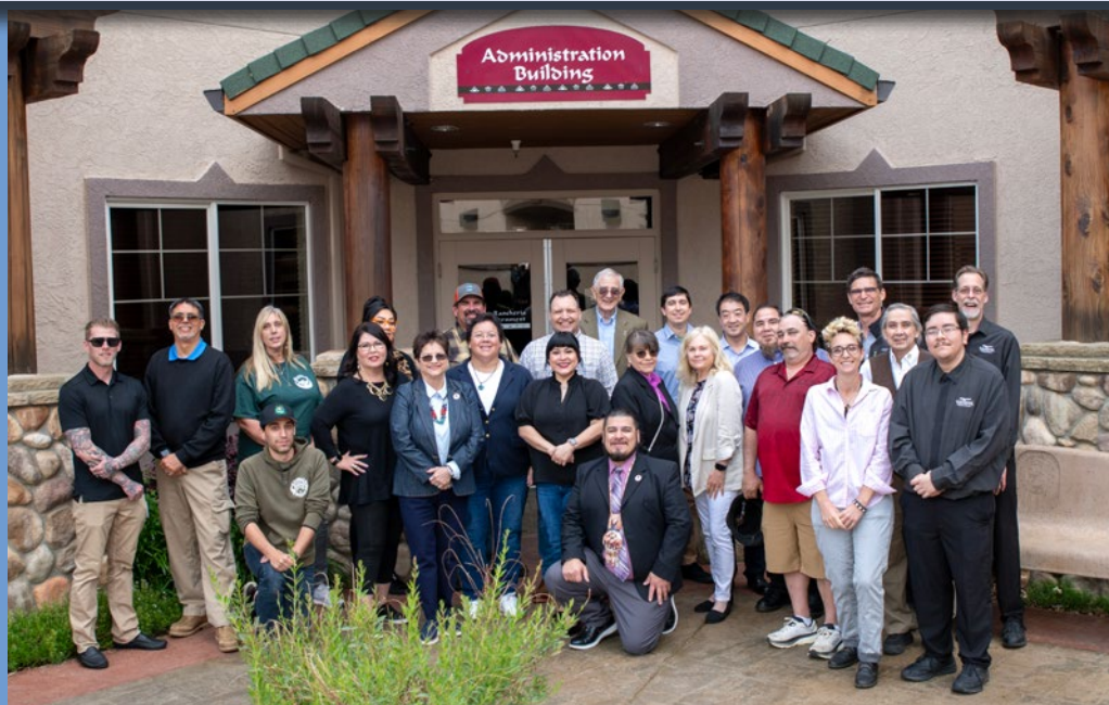
American Indian Chamber With Redding Rancheria and Summit Attendees.

To all attendees, we extend our heartfelt appreciation for visiting our home in Indian Country and contributing to the collective prosperity of our Native communities.