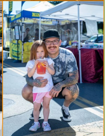
Vendors and community members at Earth Day