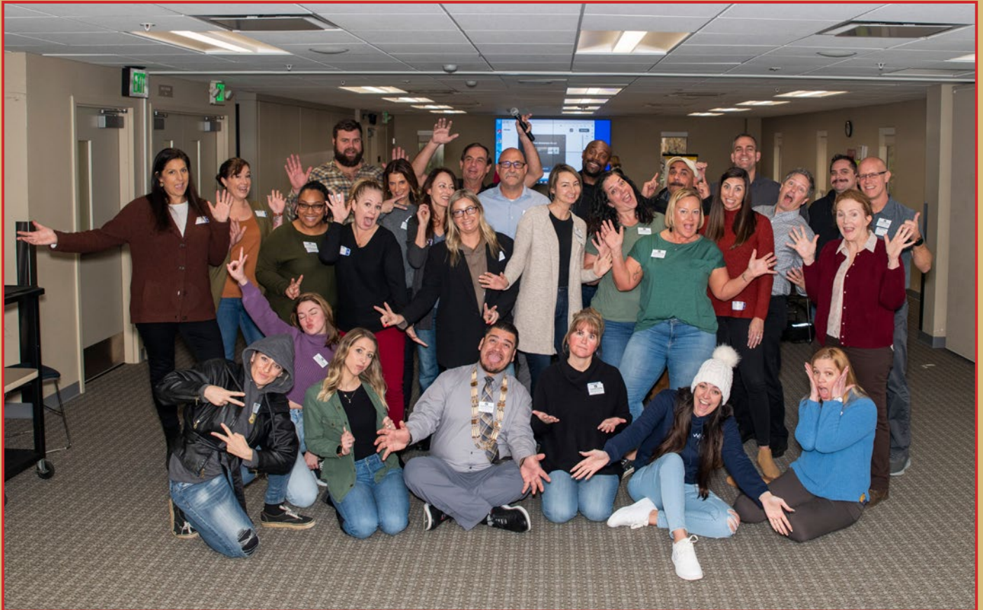
Leadership Redding Class of 2024

In essence, the Redding Rancheria Tribal Health System goes beyond being a healthcare provider; it is a cornerstone of community prosperity. By investing time and effort in ensuring the well-being of their people, the Tribe underscores the understanding that a healthy community is a thriving community. The Health System stands as a testament to the Tribe's commitment to fostering a prosperous future where the true wealth lies in the health and vitality of its people.