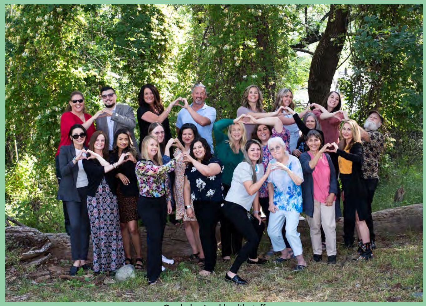
Our behavioral health staff

Redding Rancheria Behavioral Health department continues to expand to meet the need of the community. The Behavioral Health department currently spans across four campuses, Redding Rancheria Tribal Health Center, Churn Creek Health Center, Churn Creek Wellness, and Trinity Health Center. The Behavioral Health department provides a safe, supportive, and respectful climate to address experiences including anxiety disorders, Obsessive-Compulsive Disorder, Panic disorders, trauma, anger, depression, bipolar disorder, self-esteem, health related changes, career/life transitions, addictions recovery support, domestic violence, eating disorders, co-dependency, parenting support, family concerns, marital/relationship challenges, and attention deficit hyperactivity disorder. The behavioral health department includes psychiatry providers, case managers, licensed clinical social workers, licensed marriage and family therapists, licensed professional clinical counselors, and associate clinical social workers. Providers in the behavioral health department use integrated and collaborative approach to meet the patient's needs. To obtain a referral for behavioral health services at one of the four sites, please see your primary care provider.